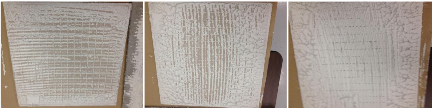
Figure 5: The tile on the left was installed using a 1/4" x 1/4" (6mm x 6mm) trowel and has approximately 30 – 35% coverage; the tile in the middle was installed using a 1/4" x 3/8" (6mm x 9mm) trowel and achieved approximately 55 – 60% coverage; while the tile on the right was installed using a 1/4" x 3/8" (6mm x 9mm) trowel with back buttered tile achieves 75 - 80% contact between the tile and the substrate.

Professional tile contractors and do-it-yourselfers are now faced with tile sizes from mosaics to large, heavy tiles of varying sizes, so becoming familiar with the proper tools and techniques to help make sure that the tile or stone is properly bedded is important. Conduct test areas, check coverage during installation, be consistent when mixing batches of mortar, back butter large format tile, clean tools frequently, make sure the substrate is flat prior to installing the tile or stone, make adjustments as necessary to achieve maximum coverage, and make sure the mortar is of suitable consistency to "wet out" the back of the tile/stone and the substrate.