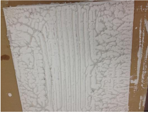
Figure 6: This tile was installed using a ½” x ½” (12mm x 12mm) trowel, the tile was back buttered and the mortar was keyed into the substrate. The coverage easily meets the minimum requirements set forth in ANSI A108.5.

From the pictures shown, a great lesson can be learned regarding proper trowel selection, while properly back buttering the tile may go a long way in making for a successful tile installation. Keep in mind that these are only guidelines, but provide a great place to start. Proper methods should be followed throughout the installation and tiles should be checked periodically to ensure that the tile is consistently achieving the appropriate coverage rates.