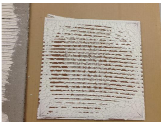
Figure 3: 18” x 18” (450mm x 450mm) tile installed using a ¼” x ¼” (6mm x 6mm) square notch trowel – insufficient coverage has been achieved.

As you can see, the 6” x 6” (150mm x 150mm) tile in Figure 2 falls into the range of proper coverage without back buttering the tile. However in the tile industry some the large jobsite failures have been due to the lack of mortar coverage on the back of the tile or stone. The most common cause for this type of failure is improper sized notch trowel selection while failing to check coverage on a regular basis.