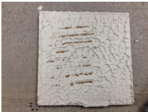
Figure 2: 6” x 6” (150mm x 150mm) quarry tile installed using a ¼” x ¼” (6mm x 6mm) square notch trowel – sufficient coverage has been achieved.

No installation of tile, stone adhered masonry veneer, or thin brick is ever exactly the same, much like the fact that substrates and jobsite conditions will vary. With this said, there is no universal rule on the proper size notched trowel required that will fit every application based simply on tile size. The guidelines for trowel sizes, as stated in National Tile Contractors Association (NTCA) Reference Manual E-23 “Trowel Guidelines” are guidelines and cannot address every installation circumstance. The substrate, type & size of tile, intended service level of the installation, climatic conditions, interior or exterior use, and individual manufacturer’s recommendations are all factors the installer should consider in selecting the proper trowel. For example, for installation of tile or stone which is 6”x6” (150mm x 150mm) or smaller, a ¼” x ¼” (6mm x 6mm) square notch trowel may be adequate. Installation of an 18” x 18” (450mm x 450mm) tile will probably require a ½” x ½” (12mm x 12mm) or ¾” (19mm) loop notch trowel. The picture below is a 6” x 6” (150mm x 150mm) tile set using a ¼” x ¼” (6mm x 6mm) square notched trowel.