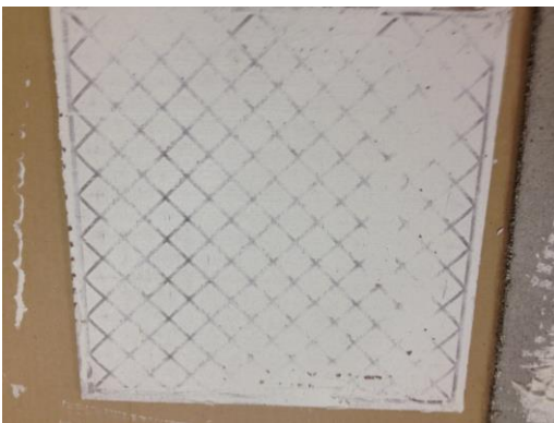
Figure 1: A properly back buttered large format tile.

So exactly how do you achieve these coverage requirements when installing ceramic tile and stone? If you're installing a tile that is 6"x6" (150mm x 150mm) or less, the answer is easy! Typically, the 80% to 95% coverage on a 6"x6" (150mm x 150mm) can be met with proper troweling techniques and most likely a 1/4" x 1/4" (6mm x 6mm) square notch trowel. However, when tile or stone starts to become larger, it becomes necessary to take extra steps to achieve the coverage that is acceptable according to industry standards. Thus the importance of properly back buttering (thin coat of thin set placed on the back of the tile to help assist in the proper transfer of thin set), as well as choosing a trowel size that is proper to the application to achieve the proper coverage.