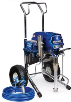
Ultra Max II 1595 Airless Sprayer