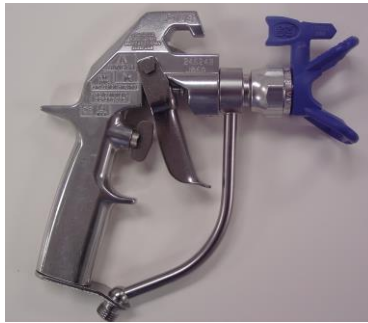
Silver Gun Plus

Follow the specific airless sprayer and spray gun manufacturer's written instructions when using their specific equipment. The Graco Silver Gun Plus ® is depicted in the following photo. This spray gun can be used for both vertical and horizontal applications. Some Spray Guns will allow filtering in the gun handle. The filters will need to be periodically cleaned and changed to ensure proper liquid flow through the spray gun and tip.