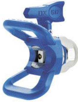
Typical LTX Sprayer Nozzle

Tip Size: LTX521 – has an orifice of 0.021” (0.5mm) and a fan width of 10” (250 mm) holding the nozzle 12” (300 mm) away from the substrate.